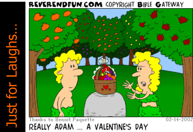
REALLY ADAM ... A VALENTINE'S DAY FRUIT BASKET ... IN THE GARDEN OF EDEN?!?

There will be other small groups available for adults. Information on those groups will be available shortly.